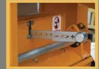
Adjustment made simple with the Unique Wakely Parallel roll gap adjustment lever.