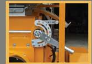
Feed Spreader Flap: Ensures a continuous even flow of feed.

The Wakely Crimper can be filled with a front-end loader or loading shovel. The crushed grain from this Mill is removed from underneath the machine using a combination of a U Trough Auger mounted underneath the Mill, this moves the crushed grain from underneath the Mill to the bottom of the Elevator. The grain is then elevated to approx. 4 meters high and can then be fed into a trailer or Silo. The rolls are mounted on high quality 70mm double roll spherical roller bearings in a plummer block unit. Discharge Auger driven by belt and pulleys.